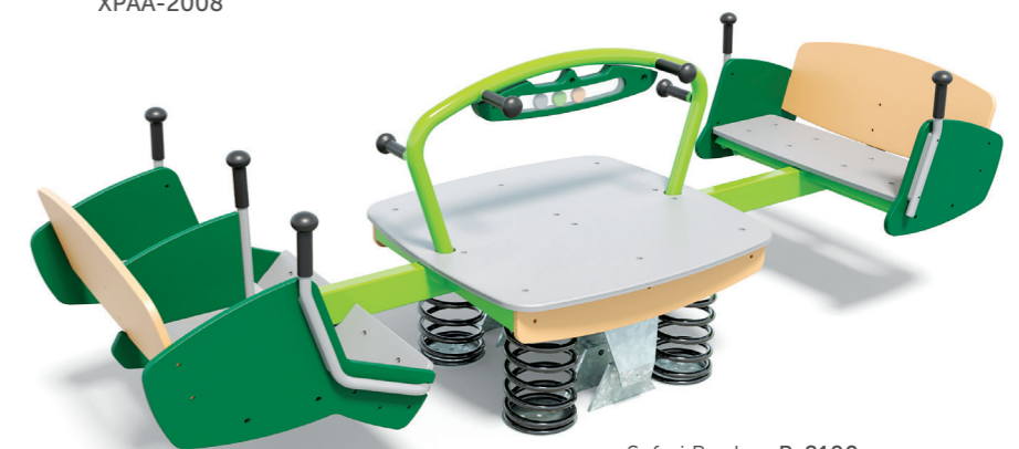
Safari Rocker, R-8100

The seats are varied to allow for different transition abilities making it easier for carers to assist children to play. Handgrips provide safety, without intruding into the seating space. A truly beautiful Invisi-clusive Play addition to any play area for all abilities.