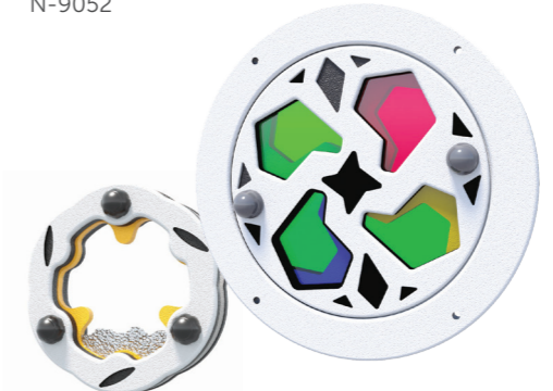
Mini Turning Balls, XPAA-2008

Each sensory and sound activity has been carefully designed by experts in the fields of Learning Support and Occupational Therapy ensuring maximum play value.